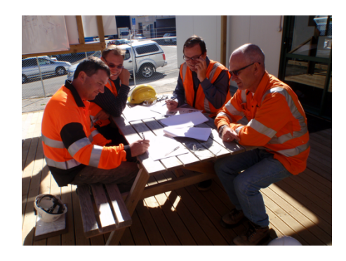
Contractors and the designers working on the Handbook content and illustrations.

A wide range of sectors have contributed to the development of the handbook which has been through several iterations during its development. This includes group discussion, peer review and testing with staff. NZUAG is particularly appreciative of the assistance given by the NZ Contractors' Federation and its members.